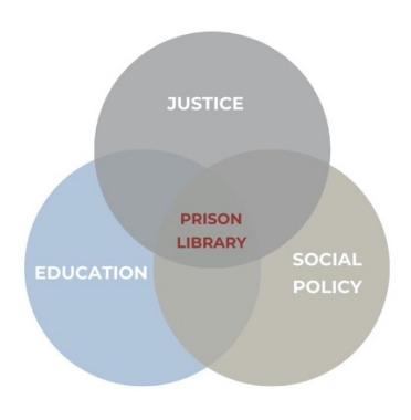
Figure 3. Prison Library and State Policies

The contribution of the prison library to the wider set of policies exercised by the state -justice, education, society- is central, and has a pivotal role in the development of knowledge, attitudes, skills and more widely the information literacy of detainees (Figure 3). It is essential that, in Greece, modern policies with substantial state provision be developed on this issue, taking advantage of new technological developments and informational needs.