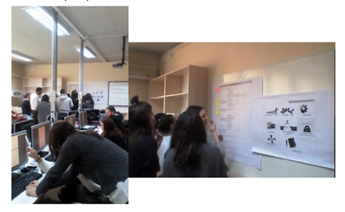
Figure 1. Workshop snapshots

in a collaborative and interaction fostering way, part of the wider topic specific dialogue. To this end, participants were also given the opportunity to contribute to the processing of a Roadmap to Library involvement in Learning Analytics initiatives (LLA).